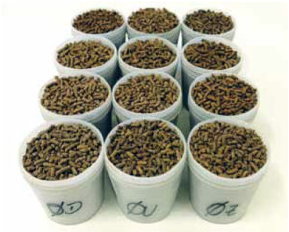
Diets used in the study contained from 0 to 2 percent fish oil and up to 12 percent fishmeal.

Despite the presence of bioflocs in the rearing system, results indicated the nutrient