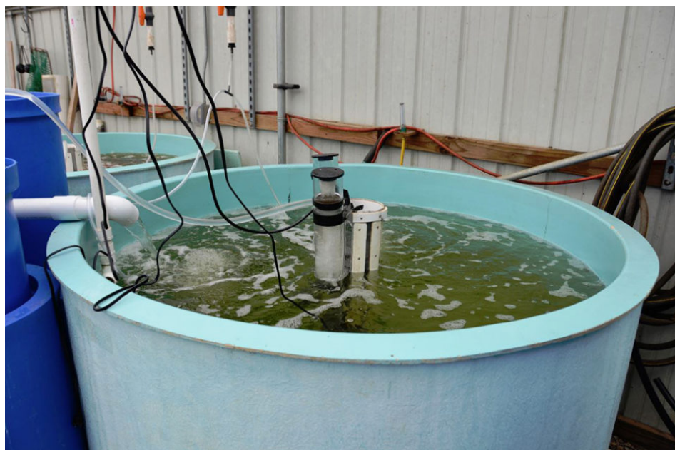
One of the clear-water tanks used in the experiment.