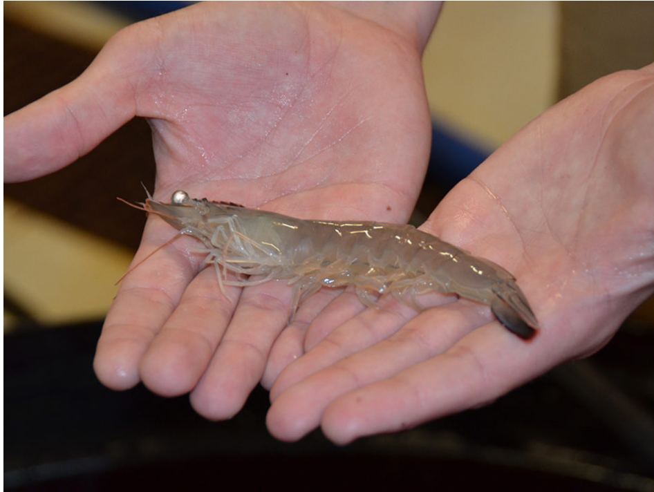
A freshly harvested shrimp from the experimental systems.

Because closed aquaculture systems have very low water exchange and controlled inputs, and because they typically have a smaller footprint than traditional open ponds, these systems are receiving increased attention to enhance biosecurity and minimize water use to culture marine species inland.