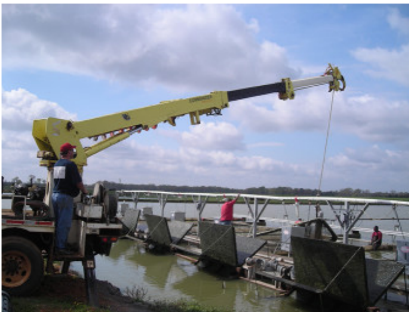
Partial harvest of an in-pond raceway in Browns, Alabama.

stocking densities of the raceways. Fish were fed a commercial, floating feed (32 percent protein, Alabama Feed Mill, Uniontown, Ala., USA) 2 – 4 times per day based on biomass, water temperature, and fish size. Catfish were harvested throughout the study as they reached marketable size (Fig. 3 & Fig. 4). Due to the ease of harvest, a range of sizes were sold based on customer demands.