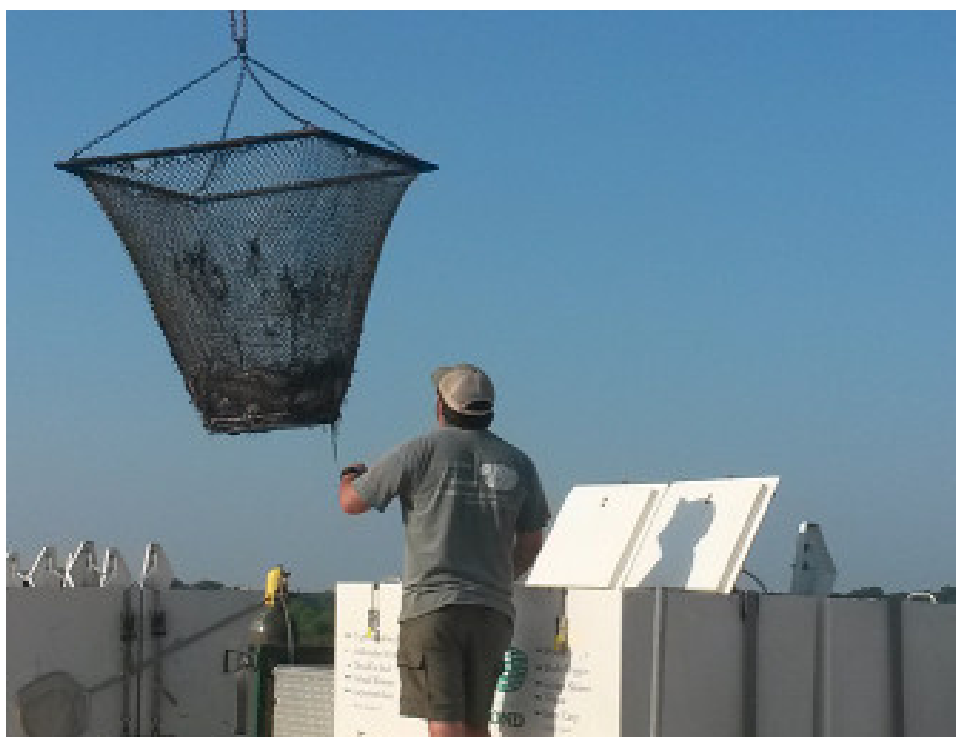
Hybrid catfish being loaded out for stocking of private ponds and lakes.