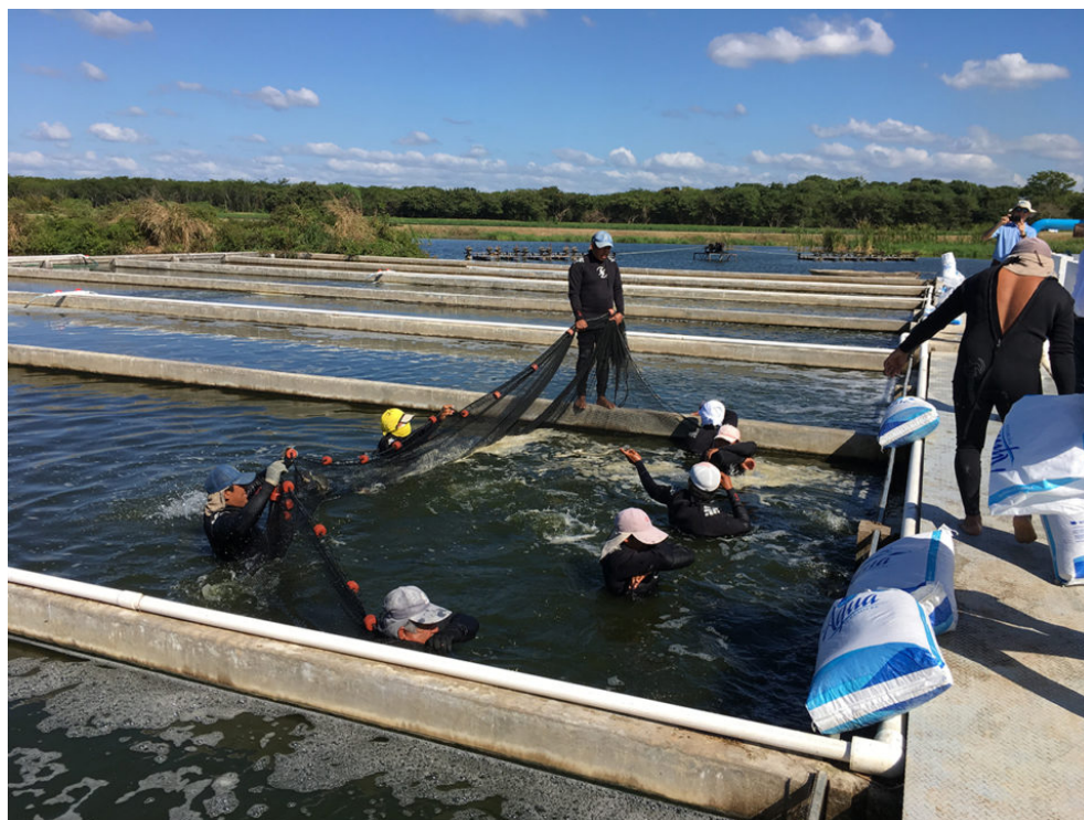
Harvesting tilapia from one of the raceways.

The second group of results includes raceways 1, 2, and 5. These raceways were stocked with 17,037 \pm 317 fish per raceway, with an individual average weight of 17.9 \pm 0.8 grams and average biomass at stocking of 2.03 \pm 0.06 kg/m 3 of raceway volume. These raceways were harvested after 116 days (raceways 1 and 2) and 132 days (raceway 5), respectively, with a final biomass of 56.9 \pm 3.3 kg/m 3 of the raceway. The average specific growth rate for this group was 2.88 \pm 0.14 percent gain/day.