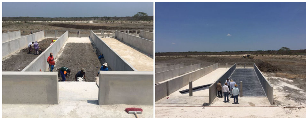
View of raceway construction for the demonstration project.

The system, built as a fixed floor project (not a floating model), was installed on a poured concrete wall footing with pond liner bottoms, and consists of seven raceways (cells), each with dimensions 5.0 m x 25 m x 1.20 m (150 cubic meter raceway volume) with a freeboard of 0.30 m. The total culture area of the raceways for holding and growing fish is 875 m 2 (1050 m 3 ), which represents 3.4 percent of the total surface area of the production pond. The raceways are equipped with five regenerative blowers providing 2.15 horsepower (60 Hz) per raceway. Additionally, the pond has Asian-style paddlewheels installed in the open water area, which helps mix and circulate water around the pond.