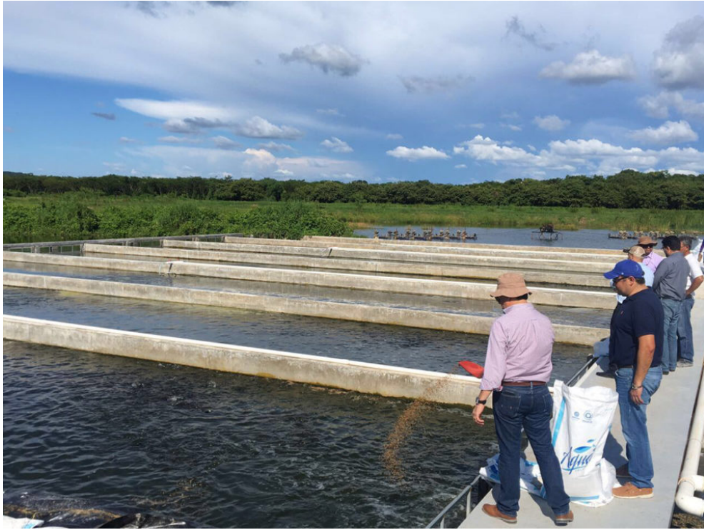
View of the some of the raceways in operation.

average weights ranging from 13.1 to 17.7 grams (biomass at stocking from 1.37 to 2.04 kg/m 3 or 97 to 116 fingerlings per m 3 of raceway volume).