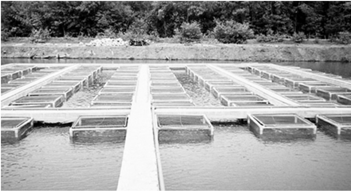
Fig. 1: The growth trial was conducted using bottomless cages in a single 0.32-ha pond.