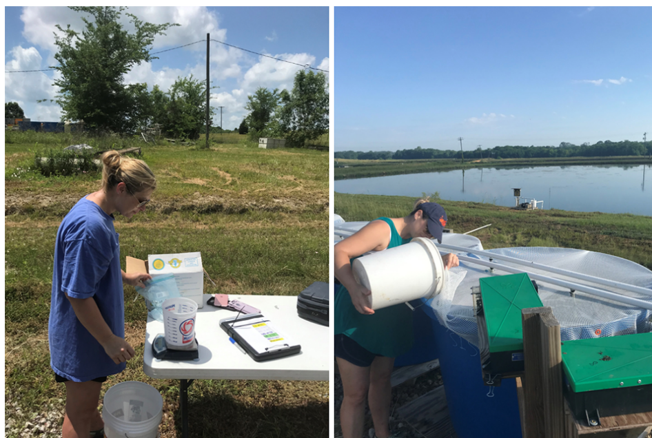
Left: preparing the LCSM to be tested at the Greene Prairie Aquafarm (GPA) in Alabama, USA. Right: GPA shrimp tanks (and commercial production pond in the background).

Numerous laboratory-based trials were conducted at the E.W. Shell Fisheries Center at Auburn University in Auburn (Alabama, USA) and at the Alabama Fish Farming Center (AFFC) in Greensboro (Alabama), at 3, 6 and 15 g/L salinities to test the efficacy of LCSM to rear L. vannamei . On-farm evaluation of LCSM along with salinity acclimation of PL was carried out in two tank-based systems installed on levees adjacent to shrimp production ponds at the Greene Prairie Aquafarm (GPA) in Alabama.