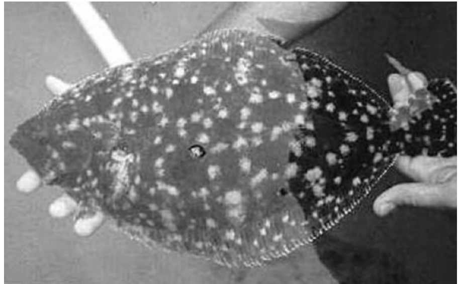
Fig. 2: Southern flounder brooder.

Great Bay Aquafarms, New Hampshire, USA, the first U.S. commercial hatchery for summer flounder, was established in 1996. It currently can produce fingerlings to support grow-out operations. Broodstock management methods for southern flounder are less advanced, but significant numbers of high-quality eggs are now being produced for research through hormone-induced and natural spawnings.