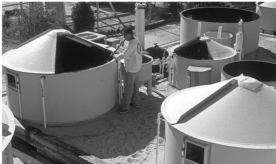
Fig. 3: Outdoor controlled-environment broodtanks for southern flounder at UNC-Wilmington.

While Japanese flounders produce up to 25 million eggs per female over a six-month period, summer and southern flounders release up to six million eggs per female during a spawning season. Relatively low fecundity and a continuous pattern of ovarian development pose significant challenges for broodstock managers with respect to availability and timing of seedstock production.