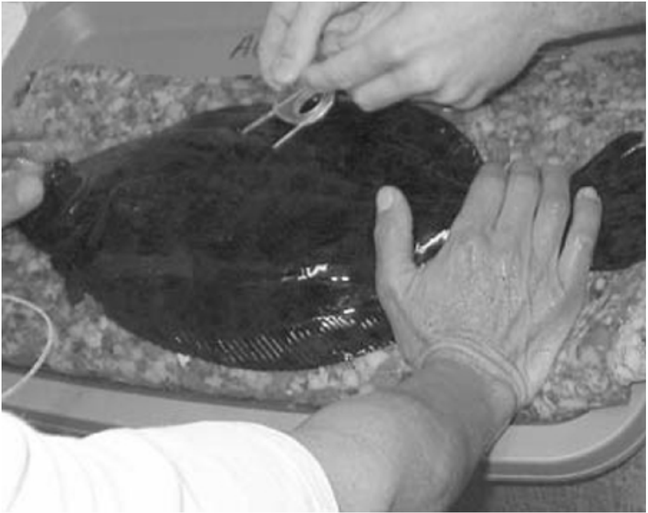
Fig. 4: Intramuscular implantation of flounder female with pelleted GnRH \alpha .