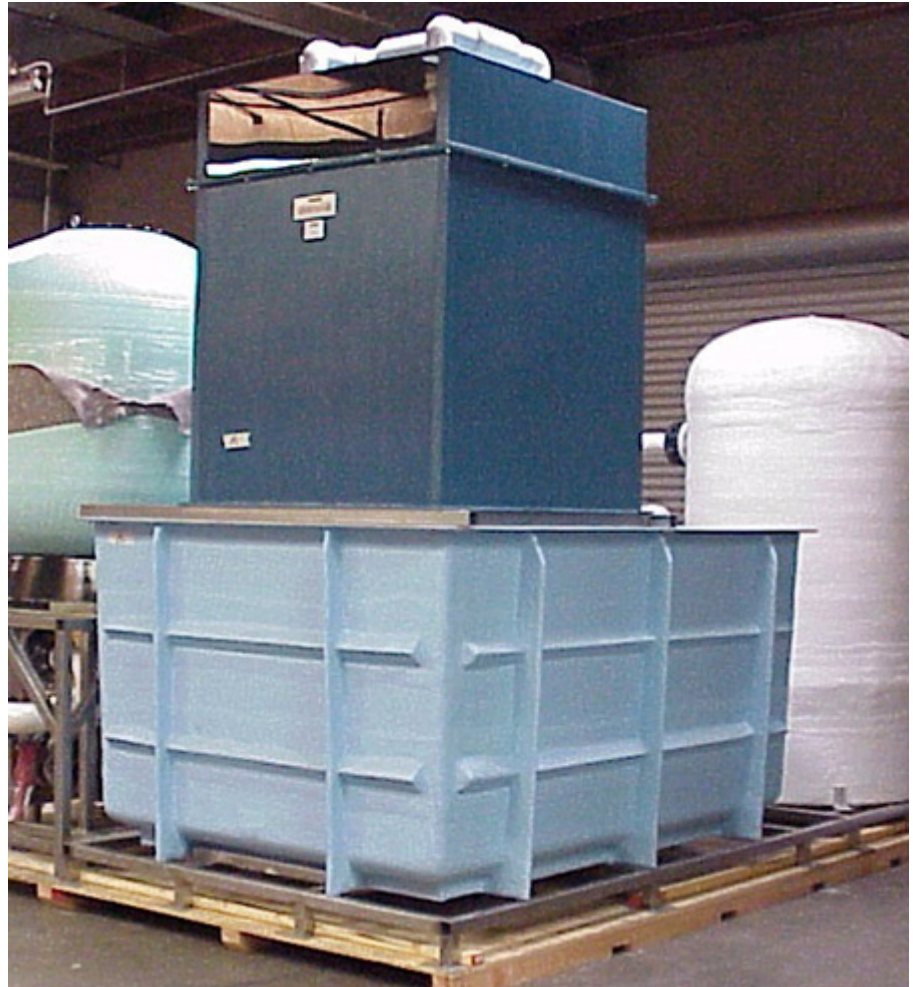
Large trickle filter.

Perhaps the oldest of the biofilters, submerged packed beds consist merely of a bed of submerged media through which recirculating water is passed. These filters generally have no biofilm or solids-management capabilities, and little attention is given to specific surface area considerations. These filters have been used with great success in seafood-holding systems, lightly loaded aquaculture systems, display aquaria, and the like. The large, inexpensive filters do a great job until they are overfed and pushed into a zone of net positive bacterial growth that renders them useless, as water can no longer penetrate the filter. Such shortcomings of submerged packed beds have been addressed by filters that can manage the solids accumulation issue.