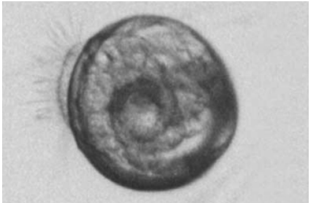
Oyster larva challenged by Vibrio tubiashii treated with Vibrio alginolyticus .

The potential probiotics were inoculated at a concentration of 104 cells per milliliter one hour prior to the addition of V. tubiashii , which had a concentration of 105 cells per milliliter. Larvae were fed daily with a combination of Tahitian Isochrysis sp. (T-Iso) and Pavlova lutheri .