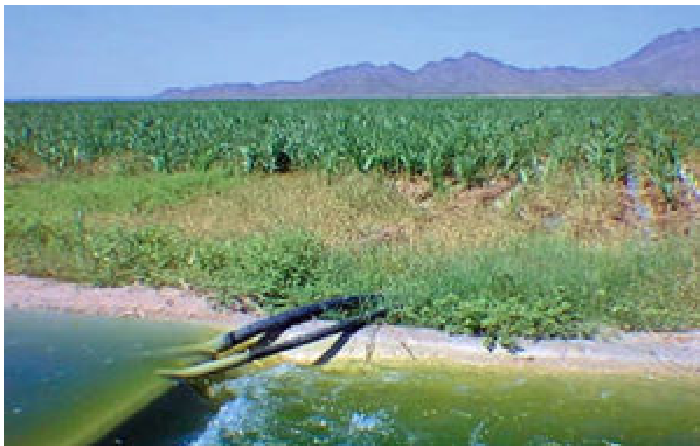
Fig. 1: Sorghum is irrigated with effluent water from Wood Brothers' Shrimp Farm. Further field trials will evaluate the effects of this water source on young olive trees.