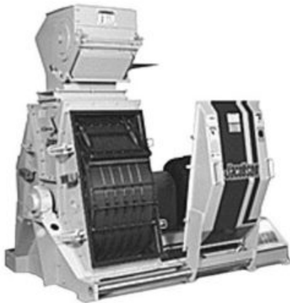
Fig. 2: Hammermill.

To achieve smaller particles would require a grinding circuit with sifters in between, to recycle coarser particles back to the hammermill for further grinding. This can be an inefficient process, particularly with