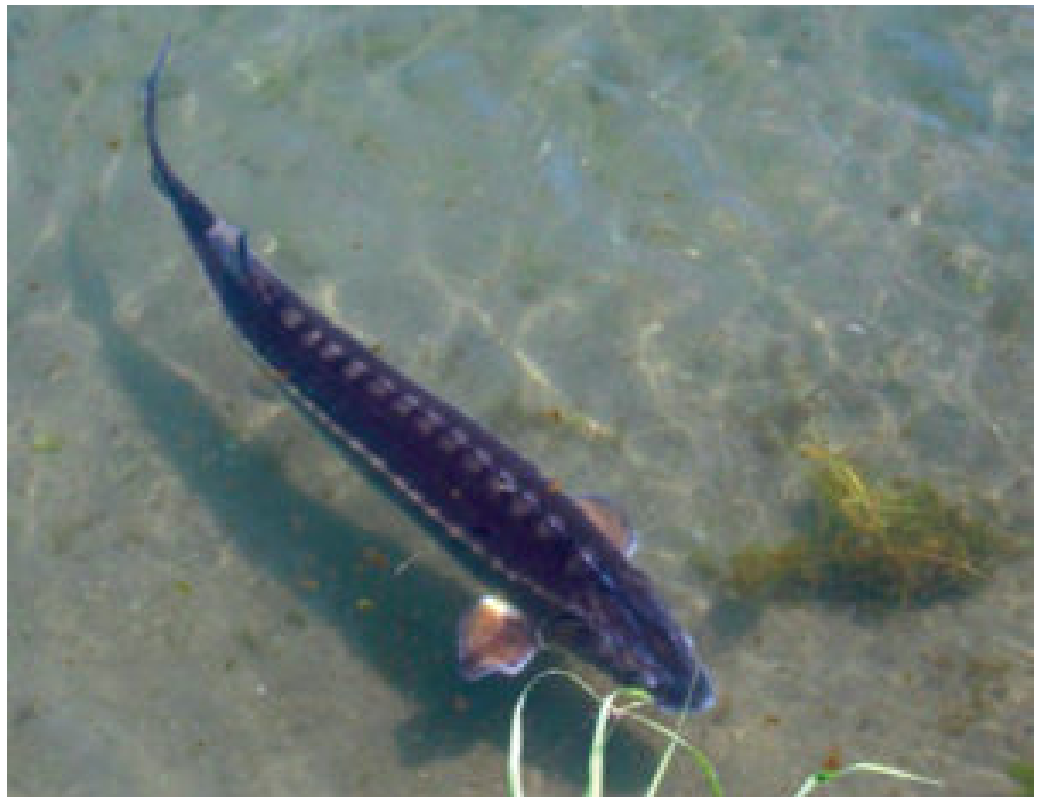
Russian sturgeon are reared in Ararat Valley ponds for both meat and caviar.

The resurgence of aquaculture in Armenia following the breakup of the Soviet Union focused on salmonid species, sturgeon and carp, with restoration of native species an important consideration. The majority of aquaculture is in the Ararat Valley with some limited facilities located in the Lake Sevan area.