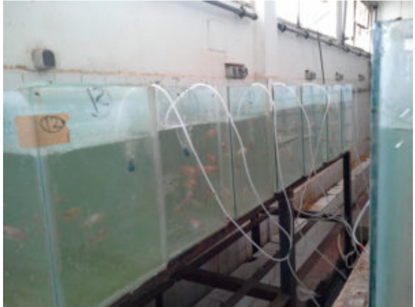
Laboratory setup keeps separate strains in different tanks.