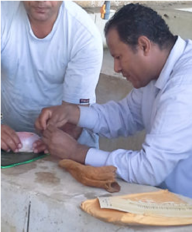
Author examining fish during selective breeding program.

improvements in aquaculture production in Africa can be achieved through similar selection programs for faster growing fish in the region.