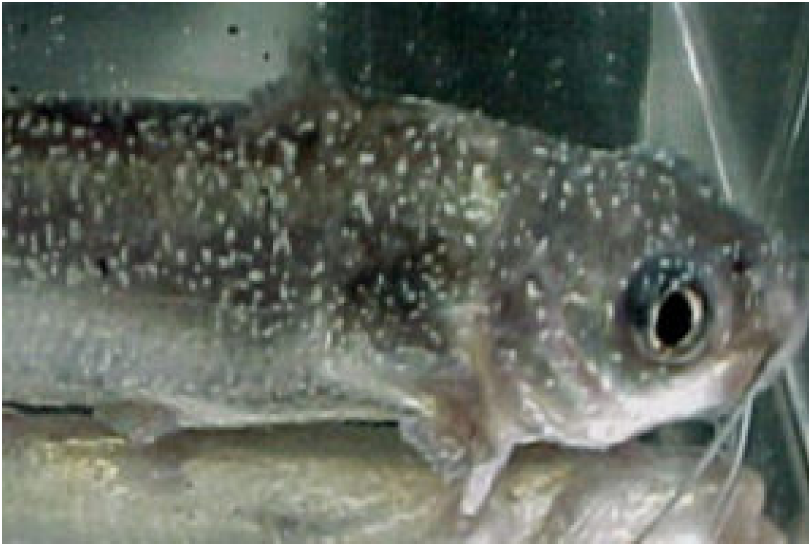
Channel catfish infected with Ichthyophthirius multifiliis show white spots on their skin.