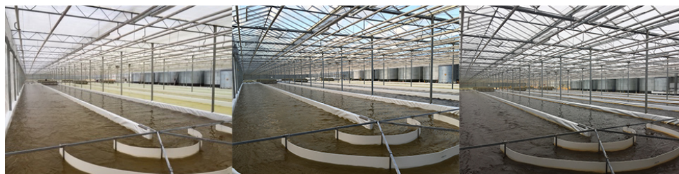
A look at the TomAlgae production facility in Belgium at various stages.

"Cultures can crush very easily, and the ability to grow the amount of the right quality required for shrimp larvae can vary a lot," he said.