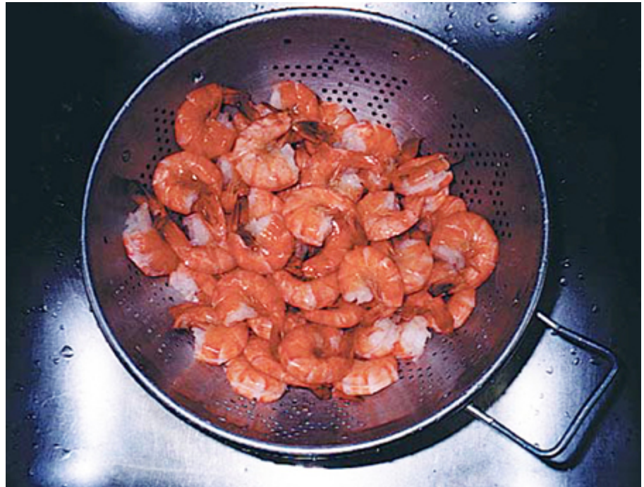
Shrimp can be part of a healthy diet.