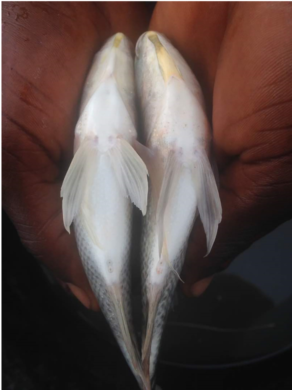
Fig. 2: Approximately 30-gram Nile tilapia male (left) and female (right) showing sexual differentiation in throat coloration and the genital papillae.

Whenever I have observed purportedly all-male fry or small fingerlings in ponds in Ghana to sizes at which tilapia sexes are identifiable, 7 to 30 percent of fingerlings have been female! At failure rates approaching 1 in 10 fingerlings as female at best, production might as well be considered mixed sex. Uncontrollable in-pond breeding and mixed sizes result from such situations and further depress growth.